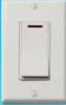
FV-WCSW11-W (white) FV-WCSW11-A (almond)