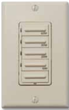
FV-WCD01-W (white) FV-WCD01-A (almond)

— Ideal for Panasonic's quiet fans to ensure you don't forget to shut them off