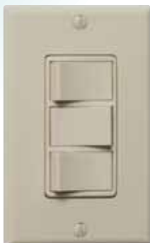
FV-WCSW31-W (white) FV-WCSW31-A (almond)