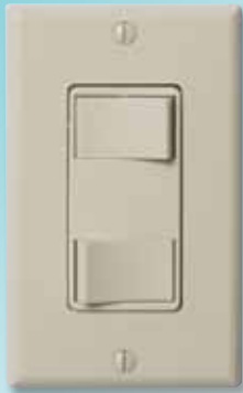
FV-WCSW21-W (white) FV-WCSW21-A (almond)