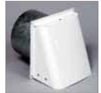
Exterior Hood included